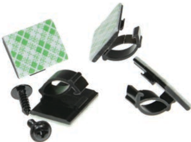
Clips and Screws