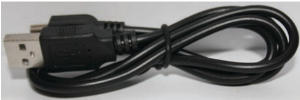
USB to Mini USB