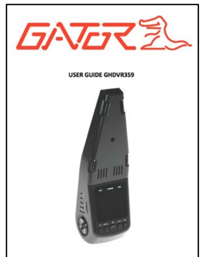
GHDVR359 User Guide