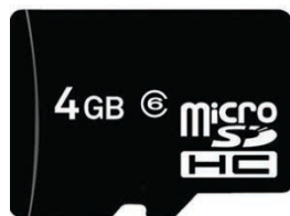
4GB Micro SD Card Class 6