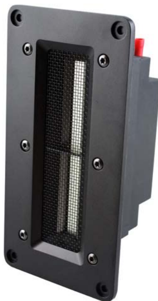
NeoCD2.0 True Ribbon Tweeter