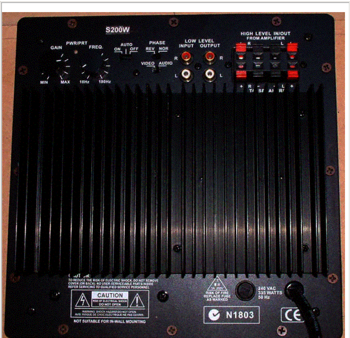
WES Components - S200W Subwoofer Amplifier