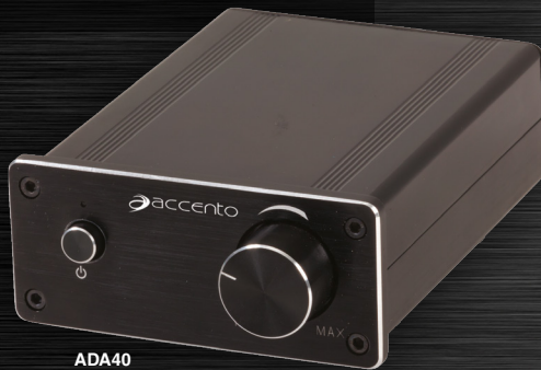
ADA40 Optional Bluetooth