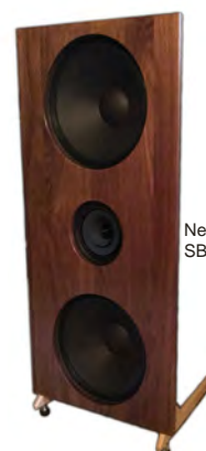
New Full-Range 8” SB20FRPC30-8

Also designed for open baffle applications, but offering an impressive Qts of 0.7 is the new 15” Bianco-15OB350 woofer, certainly a great choice for users looking for the most powerful bass in those designs. With a high power handling of 350W (AES) and an excursion of 25mm (11.02 Xmax), the 15OB350 was specified far above average. It also features a proprietary cone paper material made in-house by SBA, ferrite magnet system with 2.5” voice coil on a fibre glass former, with a vented back plate for reduced compression. As SB Audience characterizes, “the sound is punchy, detailed and dynamic in a way not usually encountered with open-baffle woofers.” Also worthy of note for speaker builders is the fact that both woofer datasheets include detailed measurements of overall, bolt circle, and baffle cutout diameters, as well as mounting depth and flange and gasket thickness.