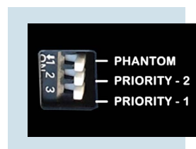
Priority and Phantom Power