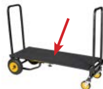
Note: trolley not included

One-piece carpeted 1/2" ply deck attaches/detaches instantly to prevent small items from falling through frame bed. Dimensions: 991x406mm.