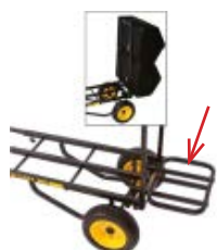
Note: trolley not included

The Rock-n-Roller® Multi-Cart® Extension Rack instantly attaches/detaches to either end of Multi-Cart increasing cubic cargo capacity by approximately 20%. Great for carrying odd shaped, hard-to-stack gear and saving that one extra trip to the car. Sturdy powder-coated steel tube frame. Fits R6, R8, R10, R12. Platform dimensions: 337x260mm.