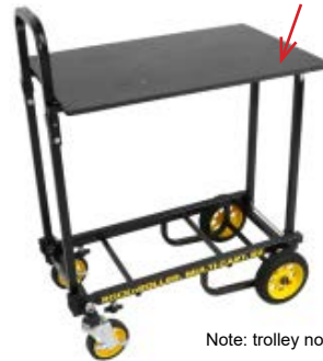
Note: trolley not included