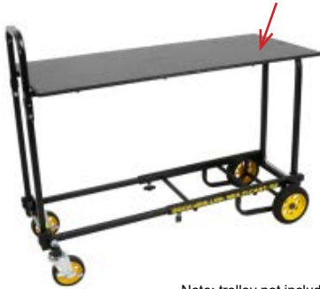
Note: trolley not included