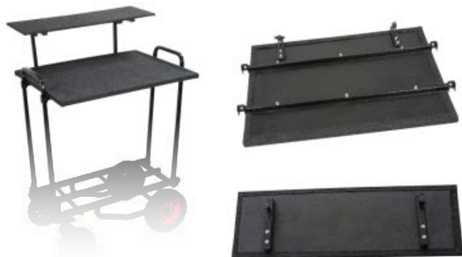
Note: trolley not included