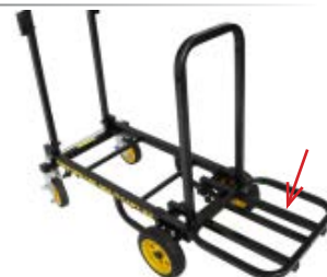
Note: trolley not included

The Rock-n-Roller® R2 Multi-Cart® Extension Rack instantly attaches/detaches to either end of the R2 increasing cubic cargo capacity by approximately 20%. Great for carrying odd shaped, hard-to-stack gear and saving that one extra trip to the car. Sturdy powder-coated steel tube frame. Platform dimensions: 318x267mm.