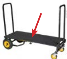
Note: trolley not included

2-piece carpeted plywood deck attaches/detaches instantly to prevent small items from falling through frame bed. Can be used as long (406x1270mm) or short (406x762mm) solid deck and stores small for easy transport. Fits cart models R8, R10, R12