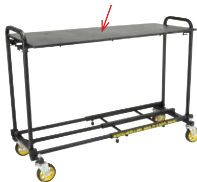
Note: trolley not included