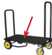
Note: trolley not included

2-piece carpeted plywood deck attaches/detaches instantly to prevent small items from falling through frame bed. Can be used as long (1473x464mm) or short (889x464mm) solid deck and stores small for easy transport. Fits cart models R14, R18