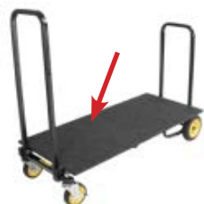
Note: trolley not included

One-piece carpeted 1/2" ply deck attaches/detaches instantly to prevent small items from falling through frame bed. Dimensions: 914x406mm.