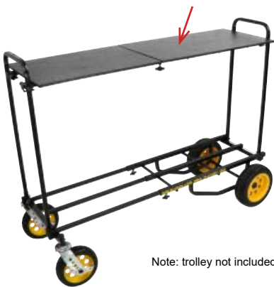
Note: trolley not included