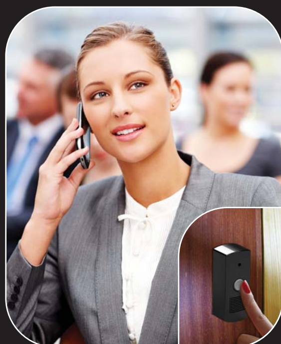
Doorbell (Mounted Outside)