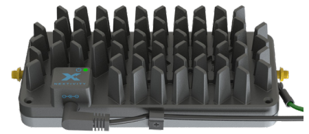
CEL-FI ROAM R41