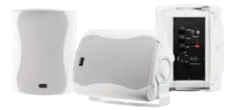
CLASS5AW 5" ACTIVE SPEAKERS (WHITE)

* PLEASE NOTE: The Class Series active speaker should not be exposed to water.