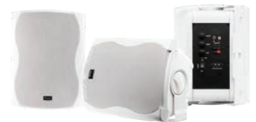
CLASS6AW 6.5" ACTIVE SPEAKERS (WHITE)