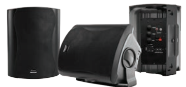
CLASS6AB 6.5" ACTIVE SPEAKERS (BLACK)