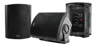
CLASS5AB 5" ACTIVE SPEAKERS (BLACK)