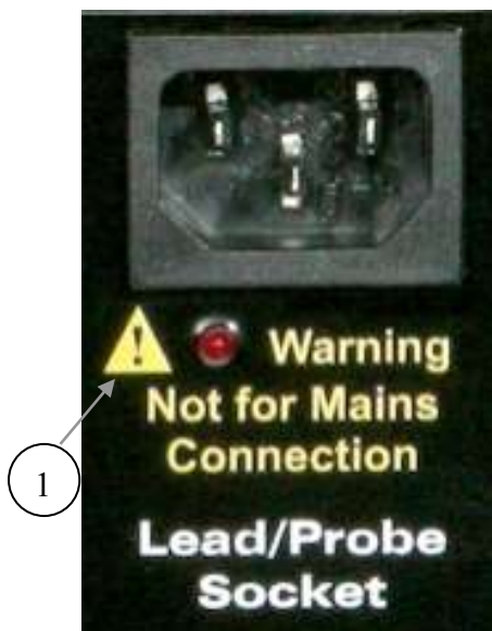
Figure 1.1-1 Warning notice on Lead/Probe Socket