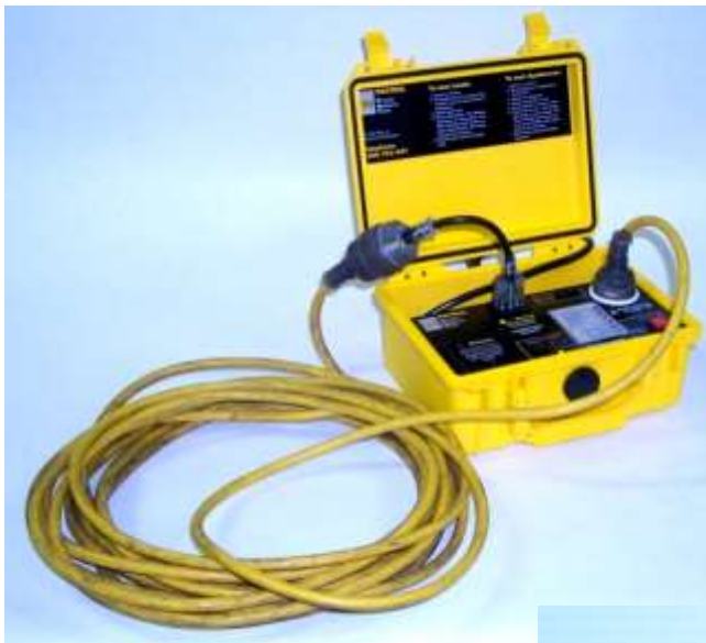
Figure 4.3-1 Extension Lead Test Connections