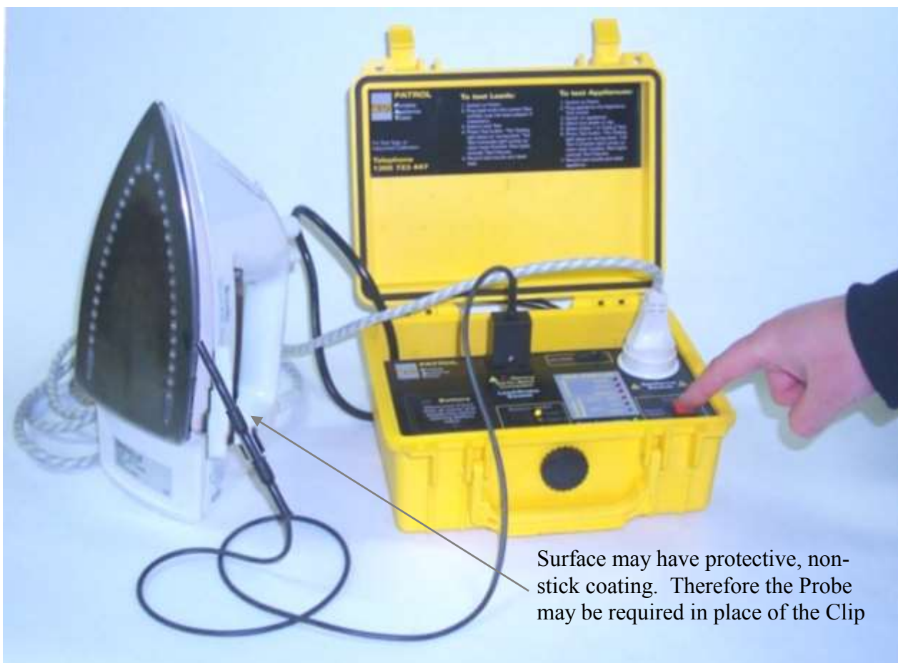
Figure 4.2.1-1 Class 1 Appliance Test connections.