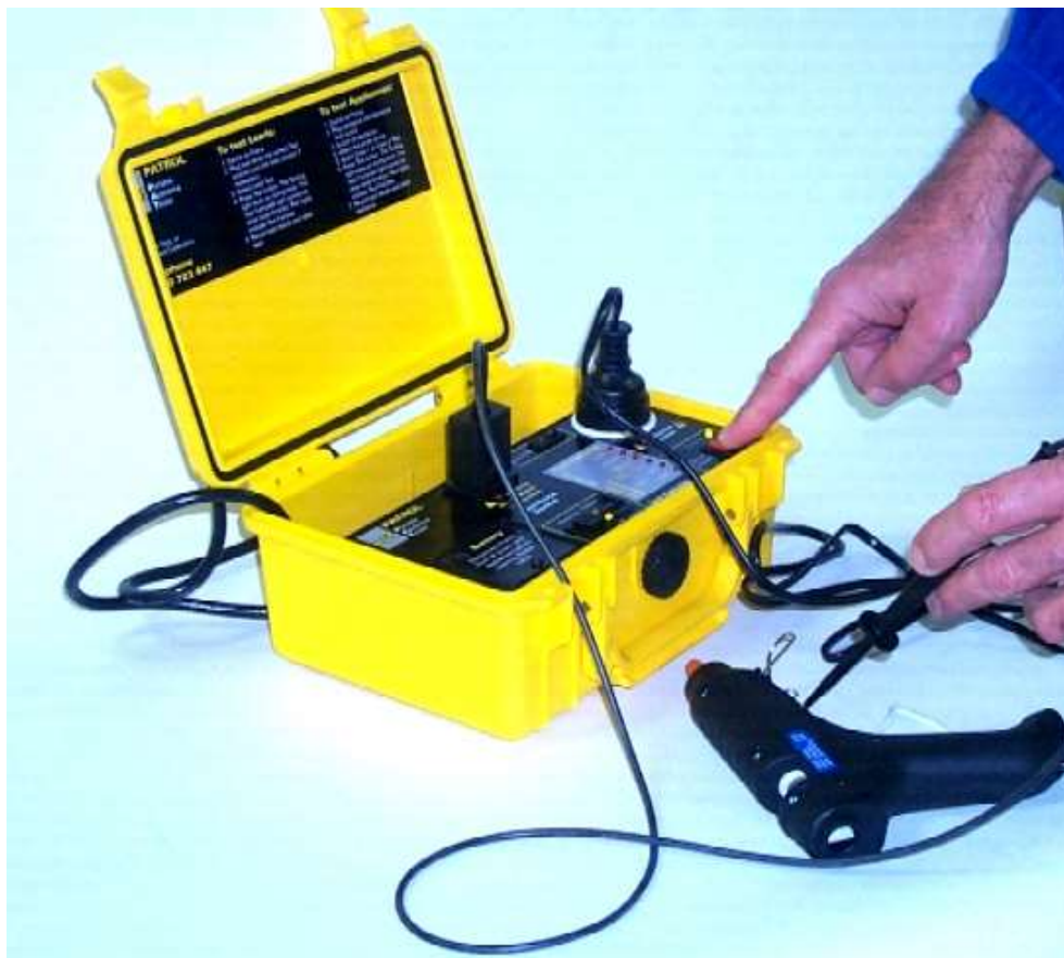
Figure 4.2.2-2 Class 2 Appliance Test Connection using the Probe