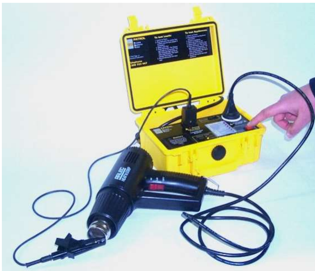
Figure 4.2.2-3 Class 2 Appliance Test Connection using the Clip