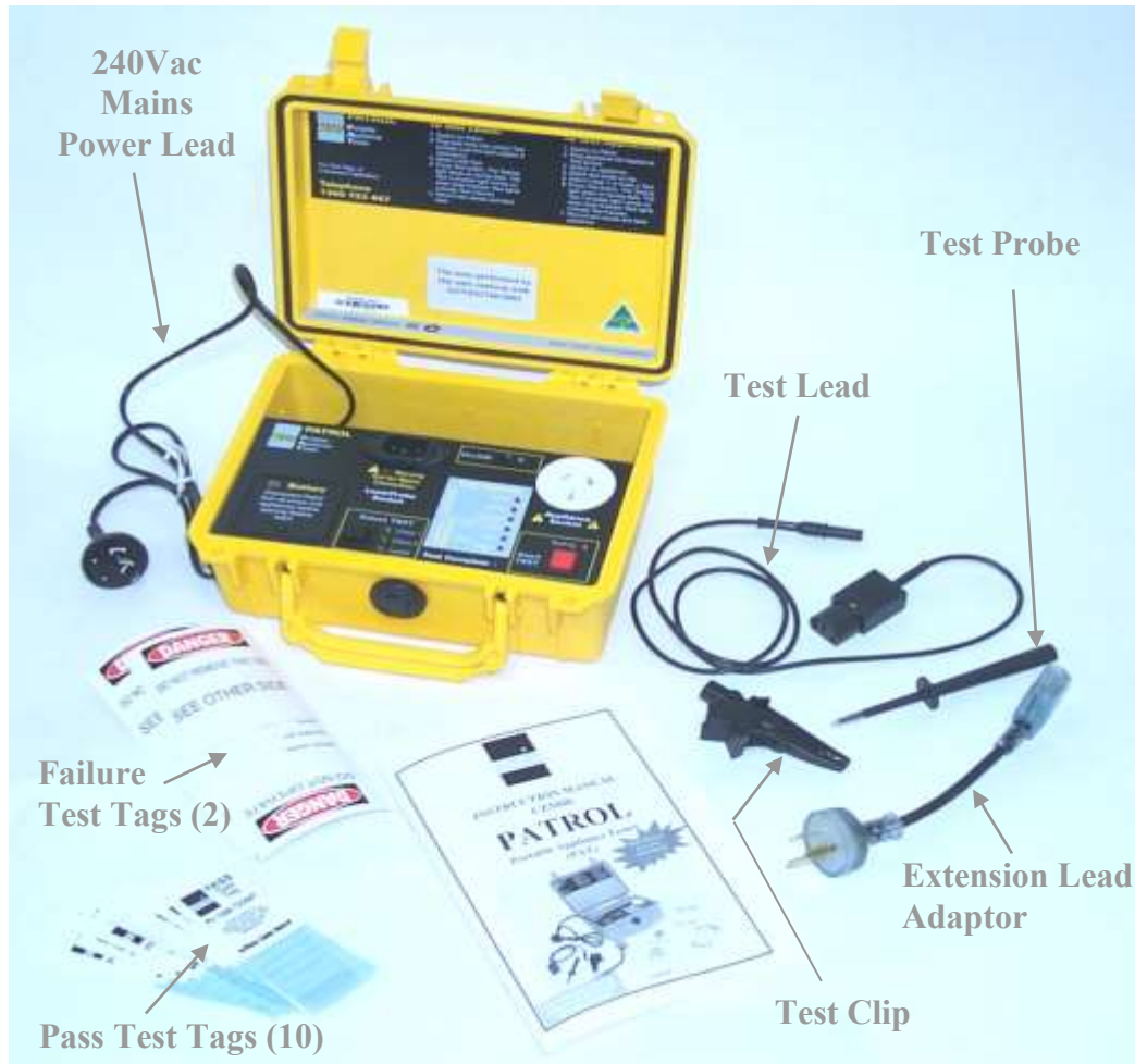
Figure 4.1-1 Components and Accessories supplied with the PATROL

This section offers the step-by-step instructions on how to set up and use the PATROL, to perform Portable Appliance and Extension Lead tests.