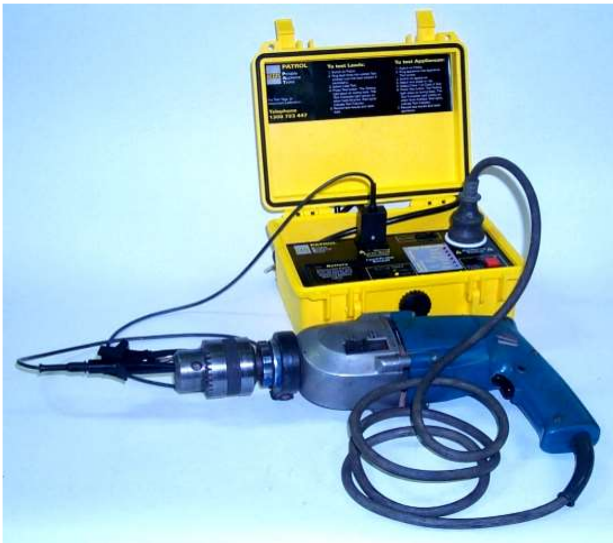
Figure 4.2.2-1 Class 2 Appliance Test connections, using the Clip