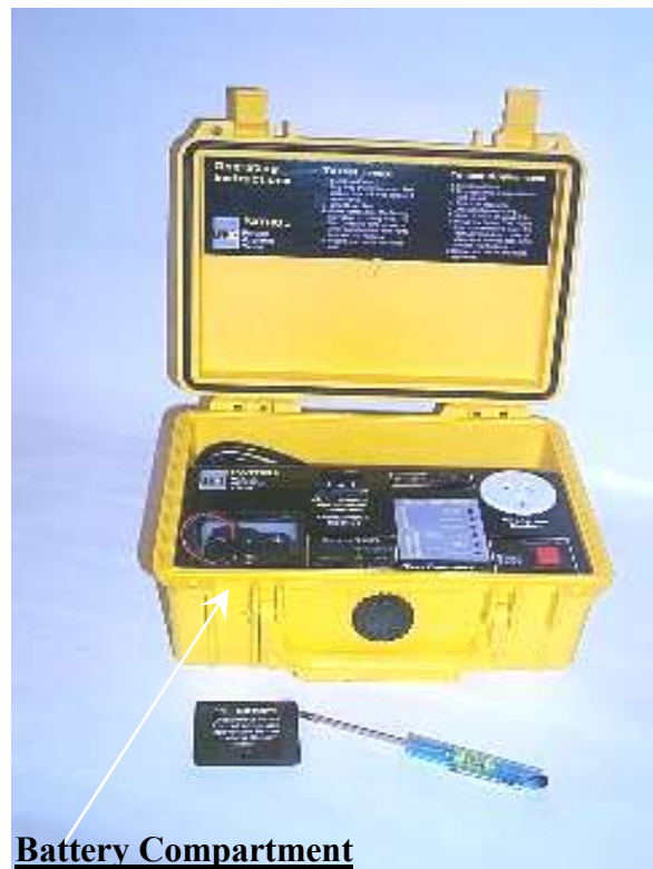
Figure 6.7-1 PATROL Battery Replacement

Note carefully the direction of the batteries when placing them into the battery holder. Use only:- AA Alkaline Type IEC-LR6 or equivalent batteries