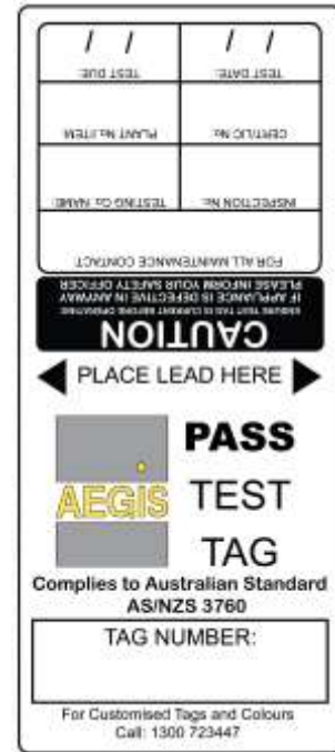
Figure 8.1-1 PASS Test Tag, Part No CZ5072 (100 tags)

Additional or replacement “PASS” Tags can be purchased from Aegis Pty Ltd by phoning 1300 723447