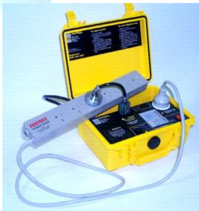
Figure 4.3-2 Multi-way Power Board Test Connections