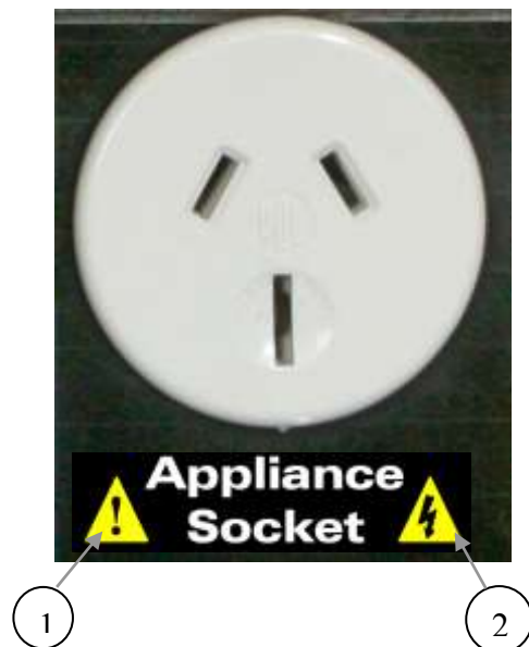
Figure 1.2-1 High Test Voltage at Appliance Socket