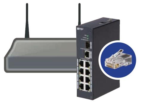
Connect via WiFi or Network Cable