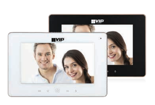
7" Slimline Touchscreen Monitor