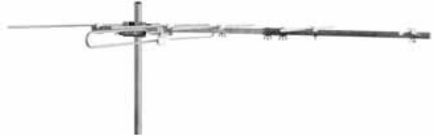
► TERZA 6HD

Important characteristics include: F connector and mast clamp with adjustable zenith.