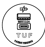
TUF A+C Charger