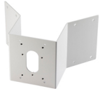
CAS-2402 Corner Mount Bracket