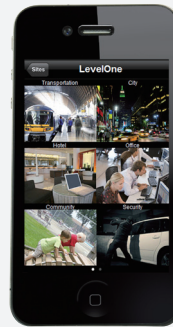
Mobile client (iOS, Android) access