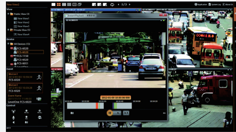
Instant playback in live view window