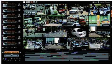
Up to 100 channels synchronized playback