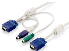
ACC-2101 1.8m KVM Cable, VGA, PS/2, USB