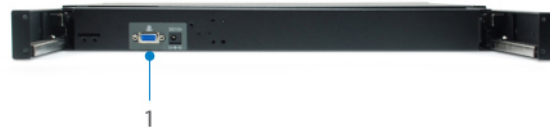
1. KCM Moudule Connector