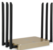
WAP-8021 AC1200 Dual Band Wireless Access Point, Desktop, Controller Managed