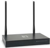
WAP-6017 N300 Wireless Access Point, Controller Managed