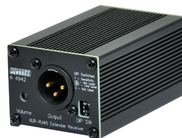
Fig 1. Redback® A 4942 Receiver (Front)

Failure to follow the correct wiring configuration may result in damage to system components.