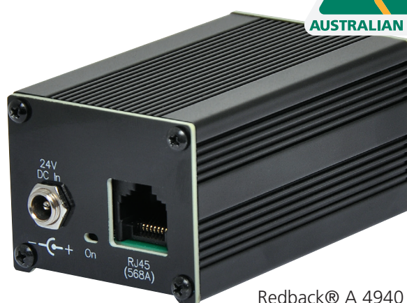
Redback® A 4940 (Rear)