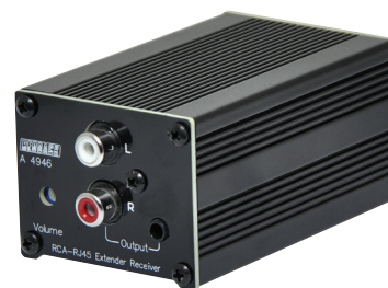
Fig 2. Redback® A 4946 Receiver (Front)

568A Straight Through (both ends) Pins Face Upwards