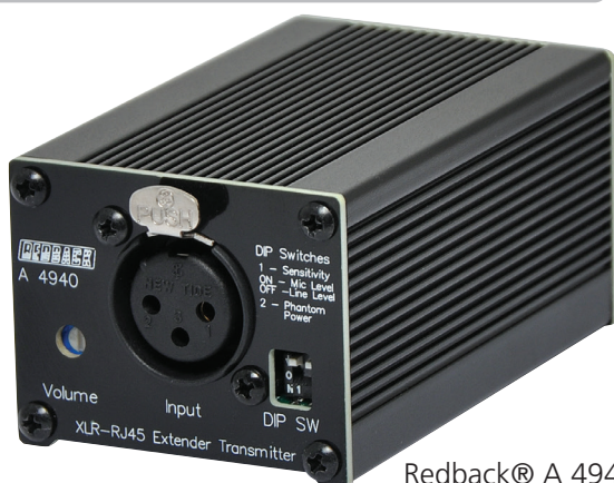
Redback® A 4940 (Front)