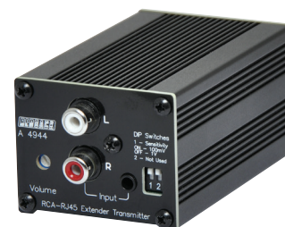
Fig 2. Redback® A 4944 Transmitter (Front)

Failure to follow the correct wiring configuration may result in damage to system components.