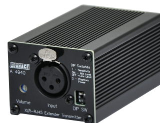
Fig 1. Redback® A 4940 Transmitter (Front)