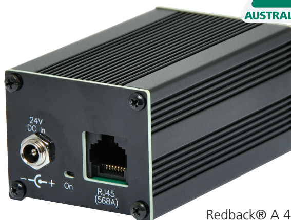
Redback® A 4942 (Rear)