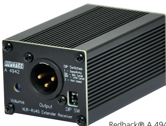
Redback® A 4942 (Front)