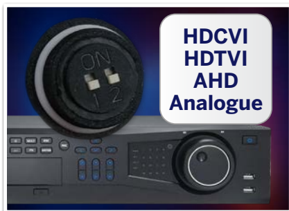
Switch Camera to Suit DVR