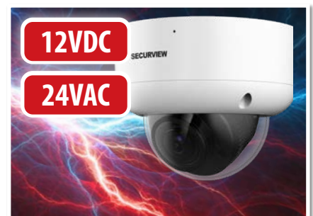
Dual Voltage Compatible