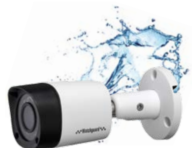
IP67 Weather Resistant