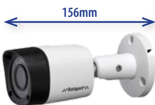
Compact for Easy Installation