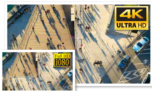
Stream Ultra HD over coax