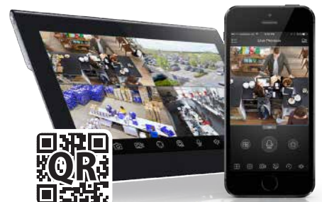
Remote view from your device