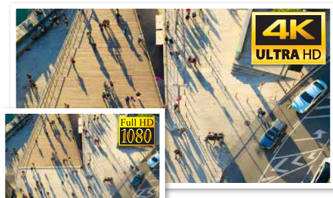
Stream Ultra HD over coax