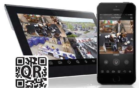
Pro 4K Motorised Turrets