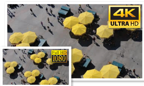
Ultra HD Recording Over Coax