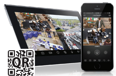
Comprehensive Remote View