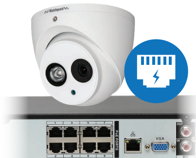
Built-in Power over Ethernet