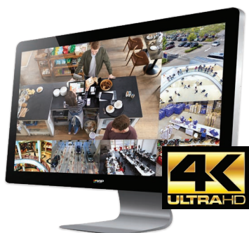
Ultra HD Record & Live View