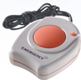
Panic/Emergency Pendant Model: WPANIC