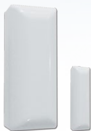
Wireless Reed Switch Model: WREEDI

Easily expand your system with door/window security, and emergency response