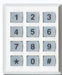
Wireless Mini Keypad Model: WKP