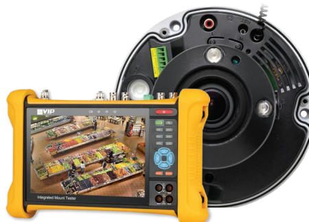
Exceptional Camera Functionality