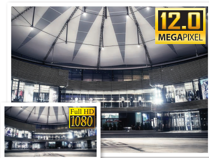
Record at Beyond Ultra HD Quality