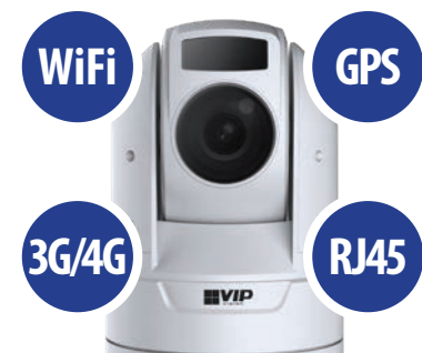
Flexible Networking Formats