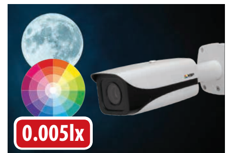
Superb Low Light Performance