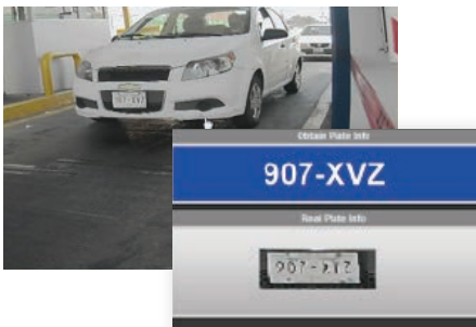
Number Plate Enhance & Recognition