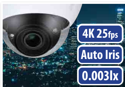
Superb Image Performance