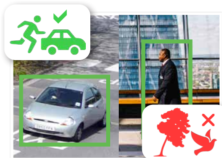
Smart Person & Vehicle Detection