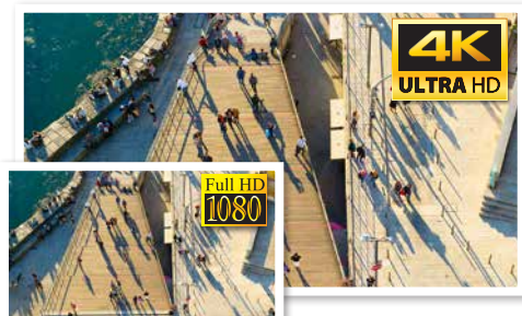
Up to 4K Ultra HD Resolution