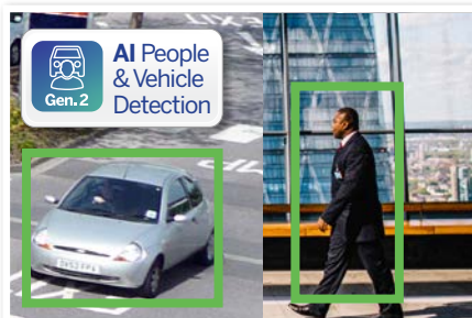
Smart Person & Vehicle Detection