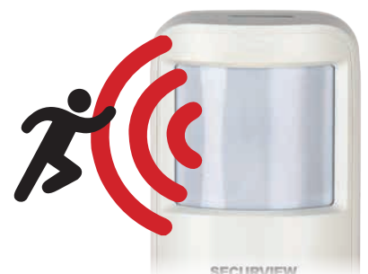
Pet Immune PIR Motion Sensor