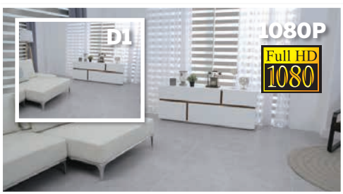
Up to 5x Image Resolution vs D1