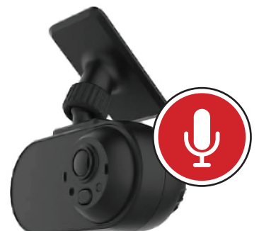
Built-in Audio Recording