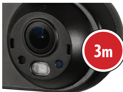
Smart In-Vehicle Infrared up to 3m